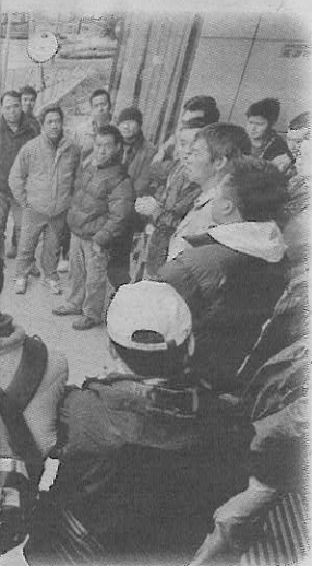
from 54 hours.

Perhaps conspiracy theorists are tem union and department are indeed on the